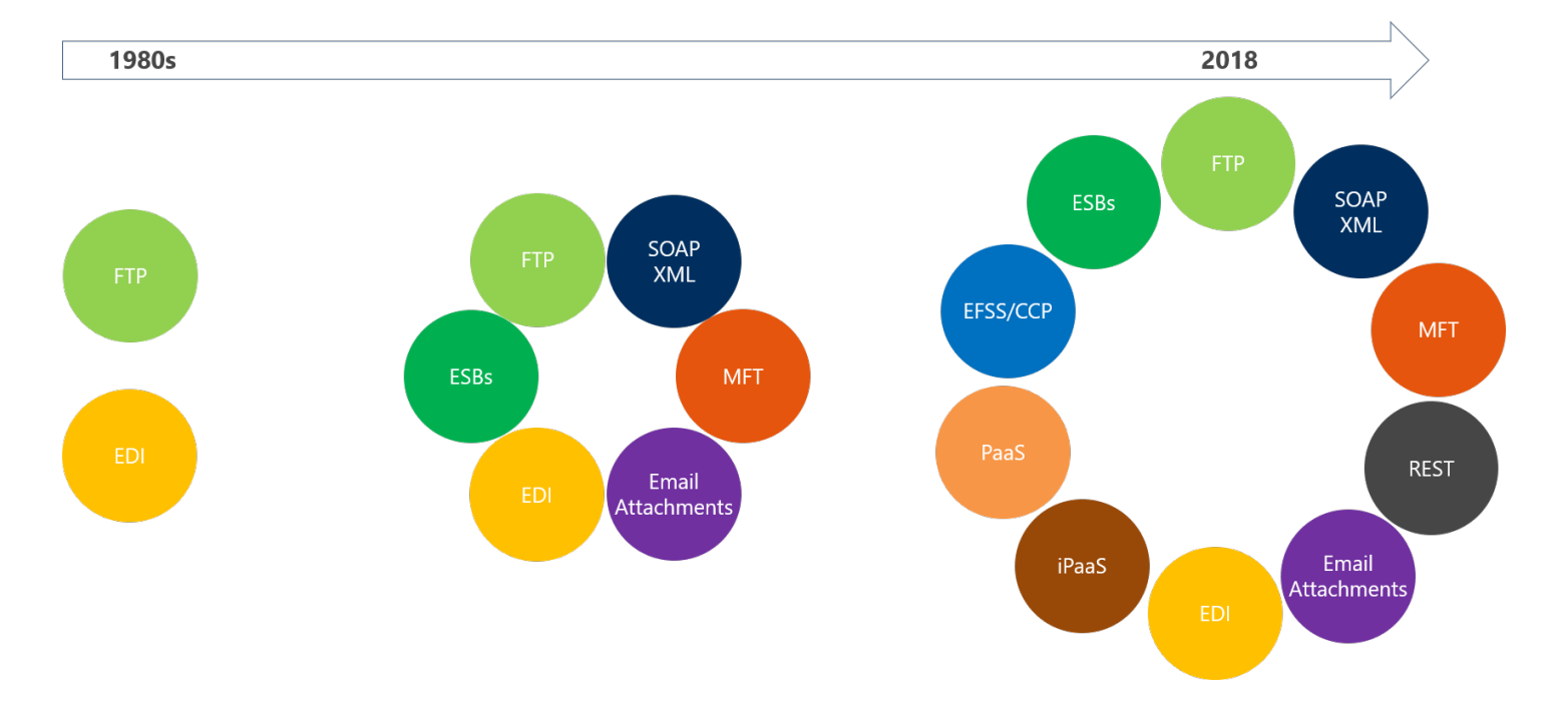
Figure 1: The Evolution of File Exchange

MFT vendors started surfacing to help with this problem and evolved to include a range of integrations for internal A2A exchange and external B2B exchange. Although FTP servers will become a thing of the past, the File Transfer Protocol itself will survive as a protocol and be used in automated file exchange. Moving from FTP servers to an MFT service was only a first step to the modernization of file exchange.